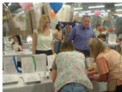
All Star Realty signs up employees for a door prize.

Discount Carowinds tickets are available at the Chamber. Through June 13, 2005, adult tickets will be on sale for $26.00. These tickets are good for any day during the 2005 season. After June 13, the tickets will be $32.00, so get yours early. Adult admission at the gate is $44.99. If you need a large number of tickets, please call the Chamber several weeks in advance so that we can have a sufficient supply on hand.